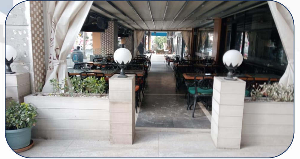
Daily Cleaning of Store Fronts