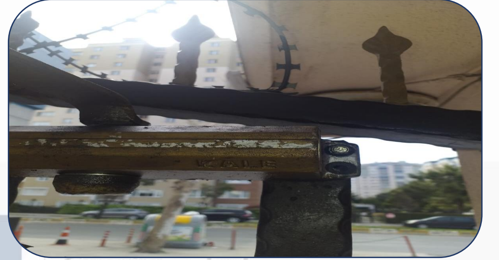
B Block Security Gate Hydraulic Repair