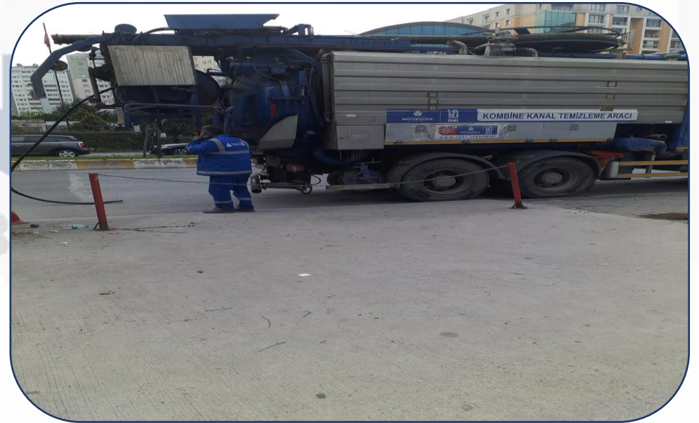
Cleaning Of Wastewater Drains