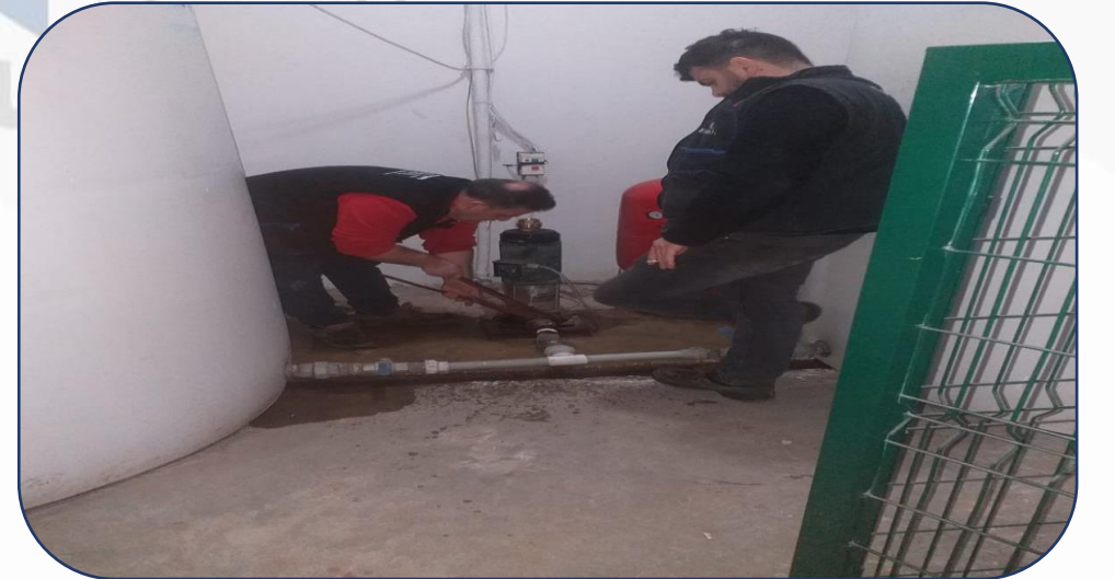
Garden Toy Repair